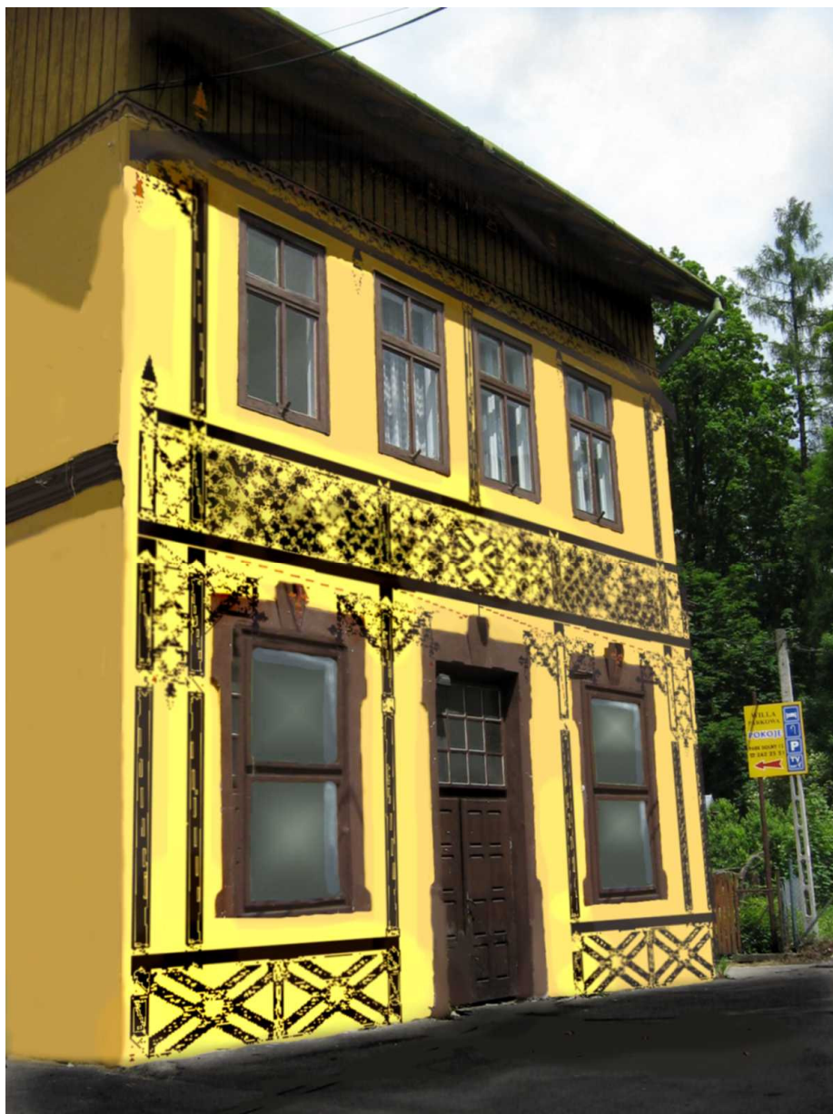
Oczekiwany stan budynku