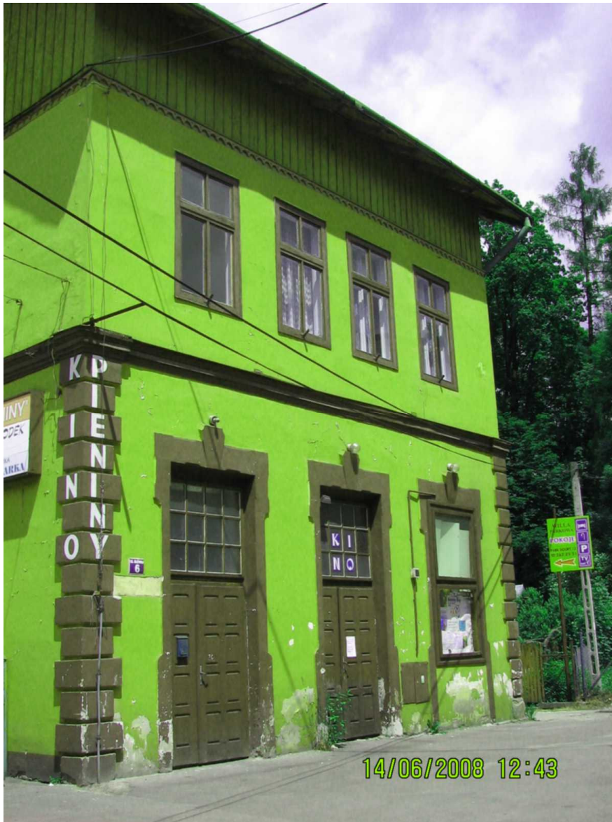
Obecny stan budynku